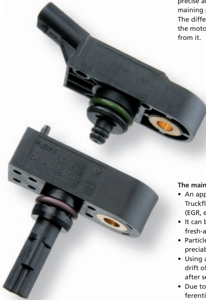
Truckflow with snap-in dp-transmitter

Truckflow works according to the differential pressure principle. The patented measurement profile of Truckflow projects into the tube section and, during flow around it, generates a precise and exactly repeatable differential pressure. The remaining pressure drops of Truckflow are practically negligible. The differential pressure sensor produces a voltage signal. In the motor management, the flow can be very easily calculated from it.