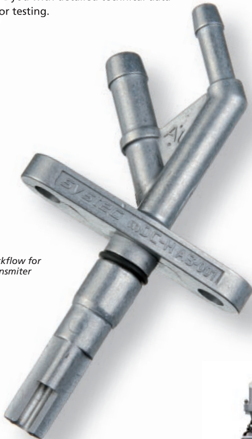
Aluminium Truckflow for separate dp-transmitter mount