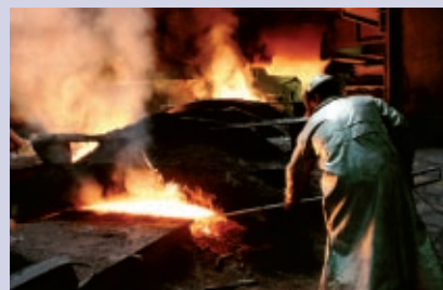
systec Controls systems have proved their utility in gas volume measuring under extreme dusty environments