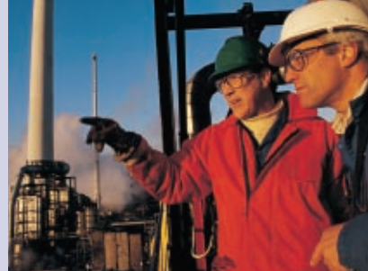
systec Controls, the innovative partner for the decision makers in all spheres of flow metering techniques

New and improved systems are prior to production and marketing exposed to stringent field tests. Measuring systems of systec Controls are again and again tested by independent research institutes such as German Federal Physics-Technical Institut, the TÜV Bavaria, TÜV Nord (TÜV = Technical Inspectorate), A.M.U or the University Erlangen. All tests have so far proved to be fully successful. The complete staff of systec Controls spares no efforts to maintain this enviable record by constant improving efficiency and ingenuity of their products. systec Controls are certified according to DIN EN ISO 9001:2000, DIN EN 7 29-3, AD 2000, EN 97/23/PED and complies among others with the directives: 13. and 17. BImSchV accord. to PED (formerly TRD), CE accord. to EMV, ATEX 100 (formerly Ex, VbF, WhG).