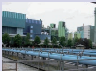
Measuring of the fluid and gas flow for the sewage treatment are primary tasks